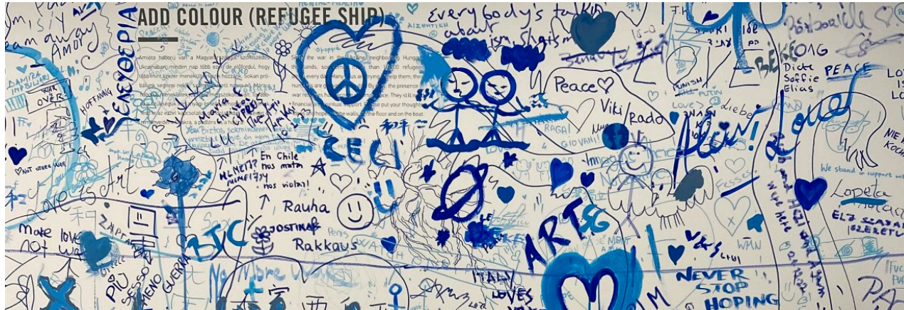
“Why?” music, animated film Plastic Ono Band (1970) / Credit: Solomiia Vatsyk / Magyar Nemzeti Muzeum

Despite the fact that each viewer may interpret Ono’s work differently, it is evident that it continues to inspire and challenge the audience. This is because some of her installations captivated viewers of all ages, races, and nationalities and caused them to reflect on their own meanings. This is not Ono’s first and certainly not her last interactive exhibition, so if you haven’t already seen it, it’s worth a look, as installations like “My Mommy is Beautiful” and “Add Colour (The Refugee Ship)” will not disappoint, but will make you creative, feel something, and understand current world events in a more intricate way.